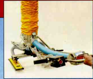
Compressed Air Assist For Special Attachments