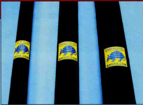
New! Armadillo™ Long-Wearing Vacuum Tubes- Now Available in all Sizes