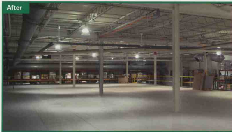
Instant-Space™ can almost double existing floor space.