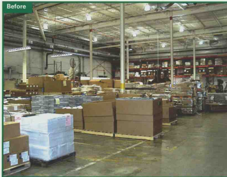
Floor space is at a premium when stock is spread out.

From design to delivery, we engineer each mezzanine we sell. We start on paper with a design you approve before proceeding to the next stage of production, for a true "what you see is what you get" preview of the product. All our mezzanines are manufactured on our premises with quality control our first priority. So whether you need us to work with your professionals or use ours for the full Cogan turnkey service, you benefit from our innovation, quality and experience that has kept Cogan on the leading edge since 1901.