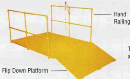
LOADING DOCK APPLICATION