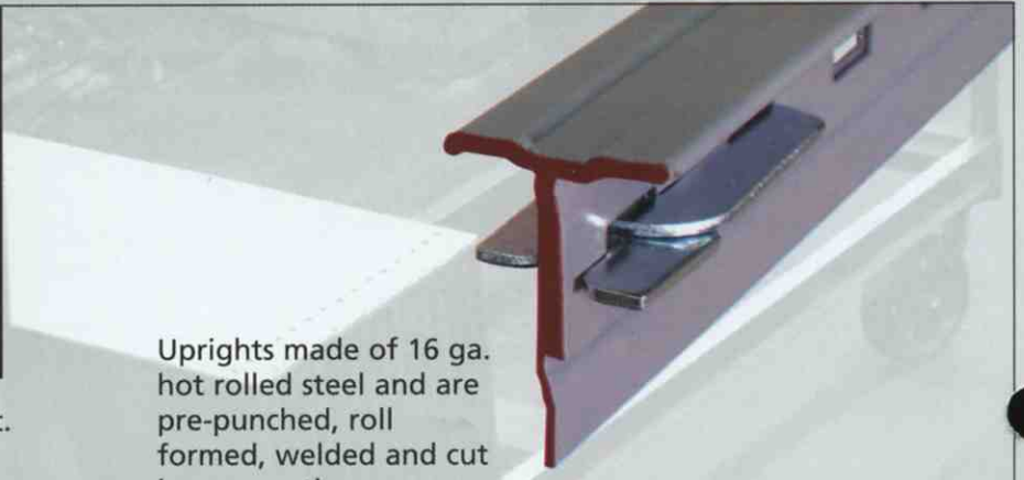
Uprights made of 16 ga. hot rolled steel and are pre-punched, roll formed, welded and cut in one continuous operation.