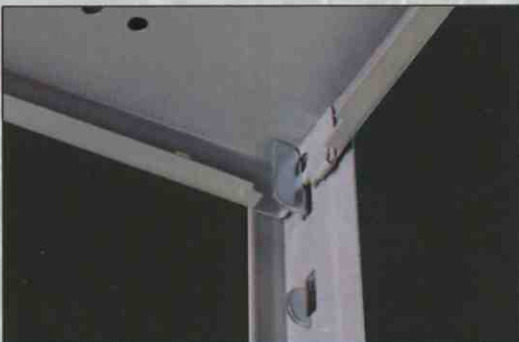
Typical view of wedge combination fit. Double lap corner and shelf bracket.

Among the most rigid in the industry. Metalware System shelving is produced in heavy gauge cold-rolled steel. Shelves are made of double-bends on all four sides, complete with closed corners.